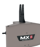
MULTIMASS 400 XS