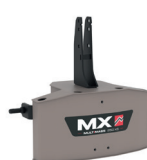
MULTIMASS 250 XS