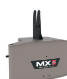
MULTIMASS 600 XS